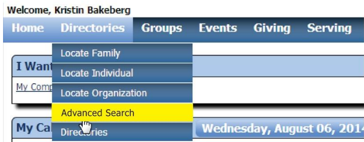
Screen Shot 1 -

Click + Select User-Defined Fields. Then select field: C- Conference. (Screen Shot 2)