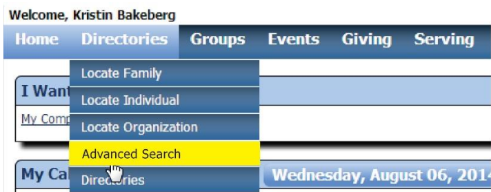
Screen Shot 1 -

Click + Select User-Defined Fields. Then select field: C- Conference. (Screen Shot 2)