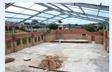
Church building project for Thanduyise congregation. This project has taken 15 years. Their goal is to be complete by the 500th anniversary of the Reformation.