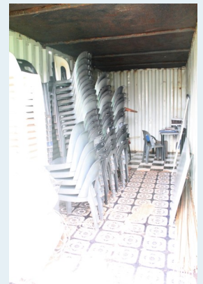
Inside the storage unit at Mhlathuze congregation. Members come at 5am every Sunday to set up a tent for worship. The plans to build their church were just approved by the city in January after a three year wait.