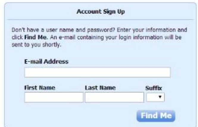
Screen Shot 1

Please contact the synod office if you would like more information. 507-637-3904